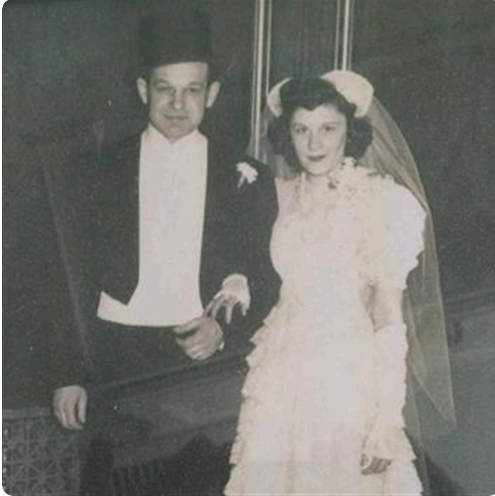
Nummy and Pop when they got married.